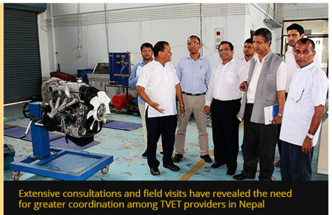
Extensive consultations and field visits have revealed the need for greater coordination among TVET providers in Nepal

Monitoring and evaluation system for TVET programme monitoring and knowledge management will be established and used.