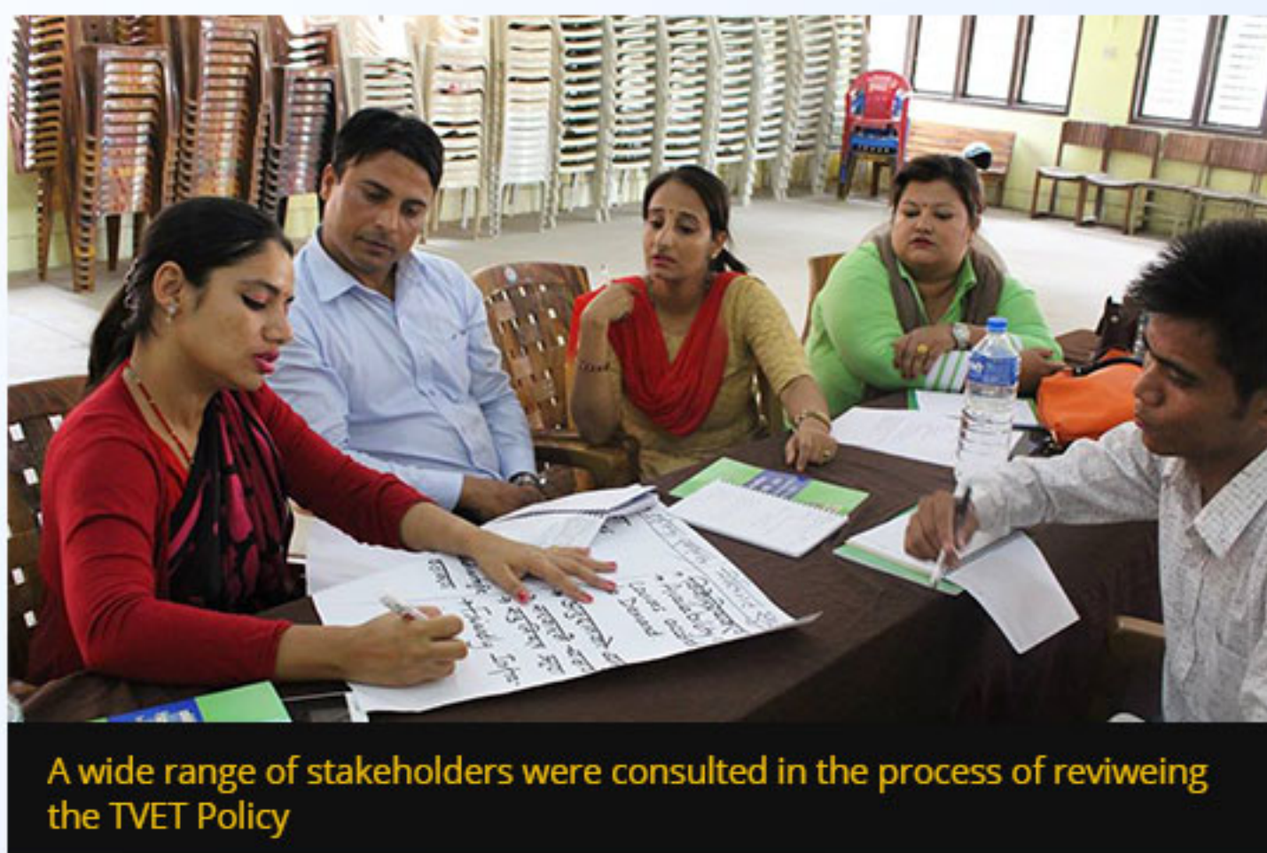
A wide range of stakeholders were consulted in the process of reviewing the TVET Policy

Many organizations—government, non-government, private, and donor-funded projects—are engaged in technical vocational education and training in Nepal. Majority of these efforts, however, are one-off and uncoordinated and not all initiatives follow the same standards. This has resulted in variations in the quality of skill training. Further, large sections of the population do not have access to TVET. These include the roughly 400,000 people that enter the workforce every year. There is therefore the need for greater coordination and a uniform policy for TVET.