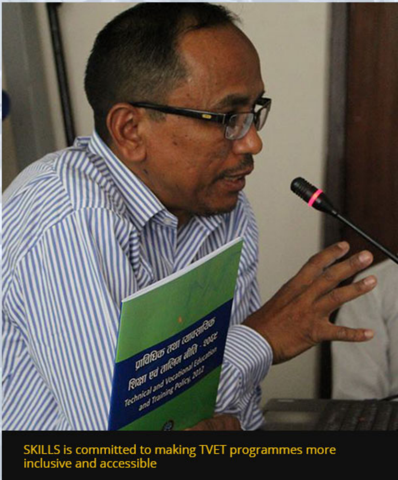
SKILLS is committed to making TVET programmes more inclusive and accessible