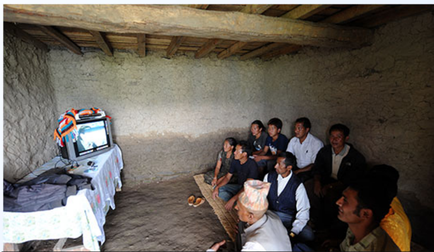
A video parlour in Dolakha run using electricity from a micro-hydro plant

Over 75% of the population of Nepal has access to electricity. However, in rural areas, this figure drops to around 60%. Most households receive electricity from the national grid and about 15% from off-grid renewable sources such as Pico hydro (<10 kW), micro hydro (10 to 100 kW) and solar home systems (SHS). There is potential for mini hydropower (>100 kW) projects, but very few have been developed owing to technical and operational challenges.