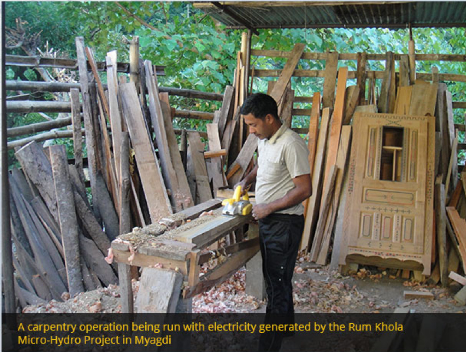
A carpentry operation being run with electricity generated by the Rum Khola Micro-Hydro Project in Myagdi